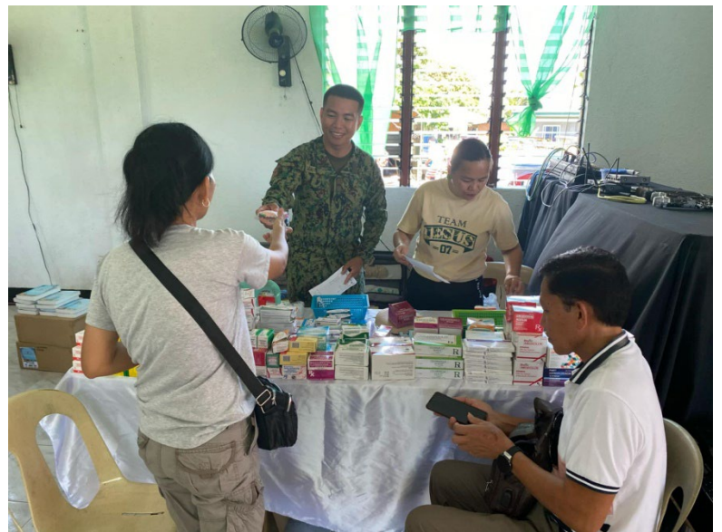
The 203 rd assisted with a medical outreach held by the first church we helped start. Checkups were done for free for the local residents, and medicines were distributed as needed. In the photo on the right, you will see a box of blue books at the end of the table. They are Bibles that were given to each patient.