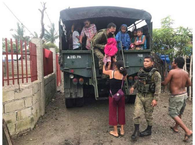
The 203 rd evacuating civilians from a “hot area”.